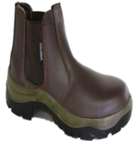
CHELSEA SAFETY BOOT BROWN / BLACK