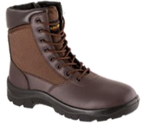
PATRIOT SAFETY BOOT BROWN / BLACK