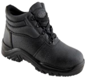
JACKAL SAFETY BOOT