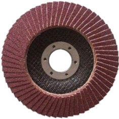
Al / Oxide Angle