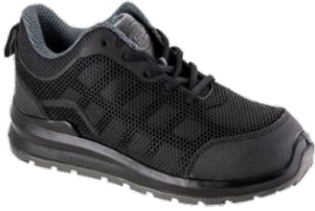
VELOCITY BLACK "TEKKIE" SAFETY SHOE